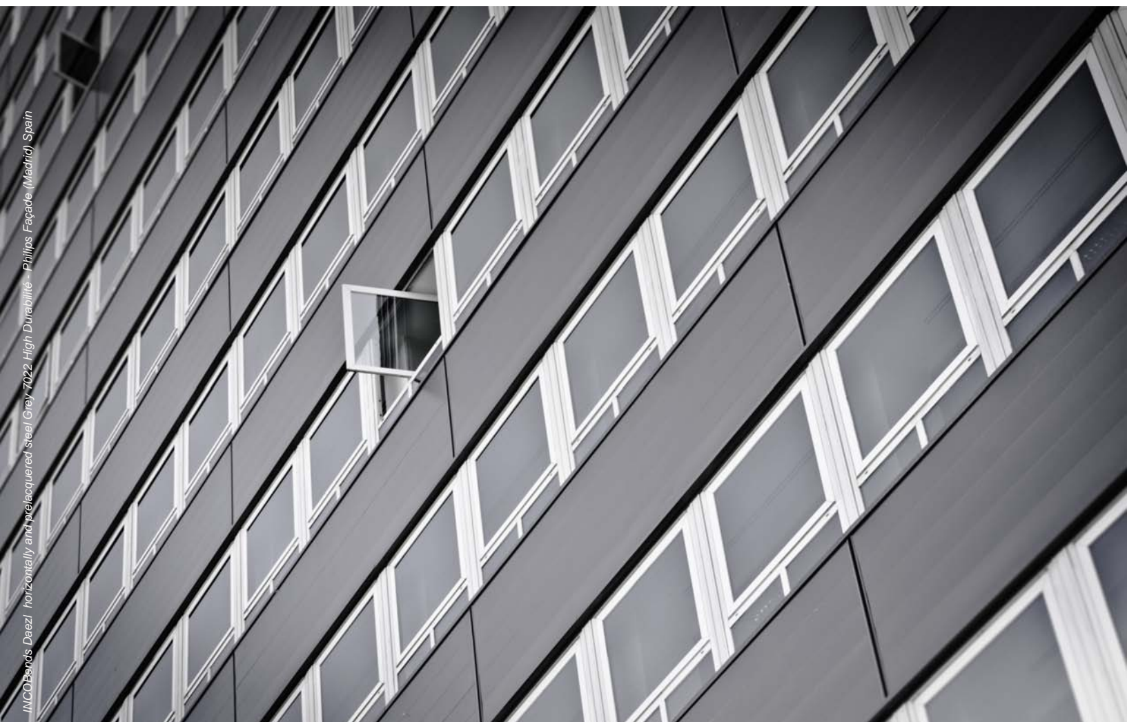
INCOBends Daezl horizontally and pre-lacquered steel Grey 7022 High Durability - Phillips Façade (Madrid) Spain